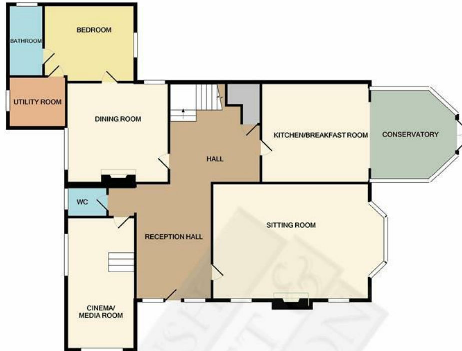
GROUND FLOOR APPROX. FLOOR AREA 1468 SQ.FT. (136.4 SQ.M.)