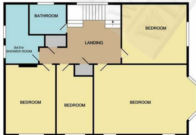
1ST FLOOR APPROX. FLOOR AREA 1088 SQ.FT. (101.1 SQ.M.)